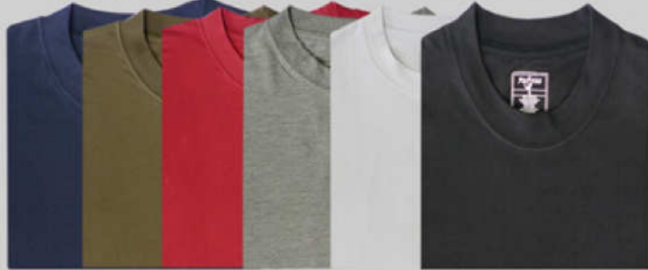
Style 490 100% Cotton Pocket Tee Shirt