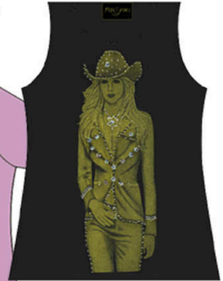
style # 7000 90

Available colors: Lt. Blue - #10 Green - #35 Dark Pink - #40 Lt. Pink - #45 Black - #90