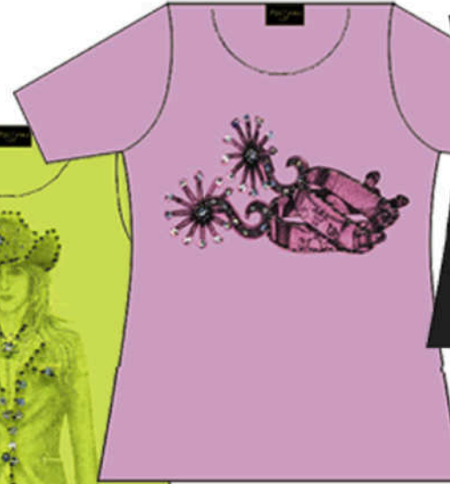
style # 8003 45