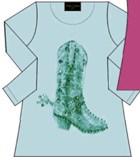
style # 9001 10

Designs printed, then accented with sequins, beads and glitter 100% poly soft knit