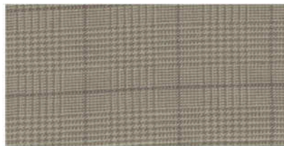
#99 Plaid Combo