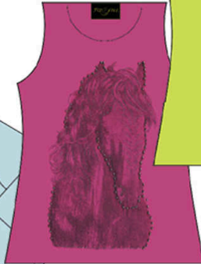
style # 7002 40