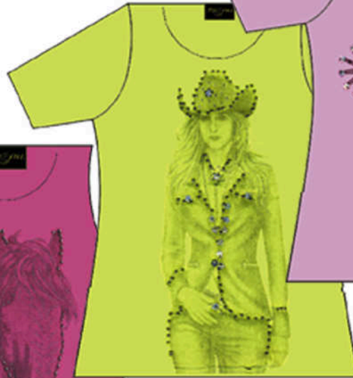
style # 8000 35